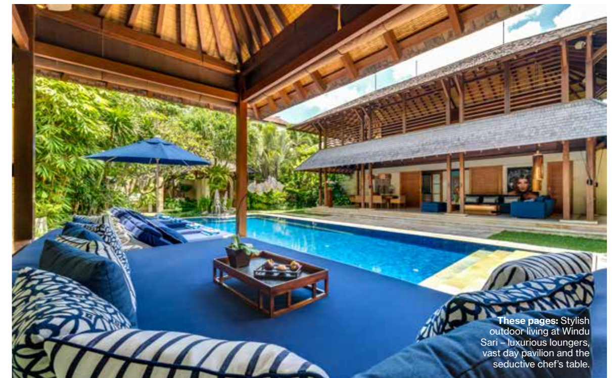
These pages: Stylish outdoor living at Windu Sari – luxurious loungers, vast day pavilion and the seductive chef's table.