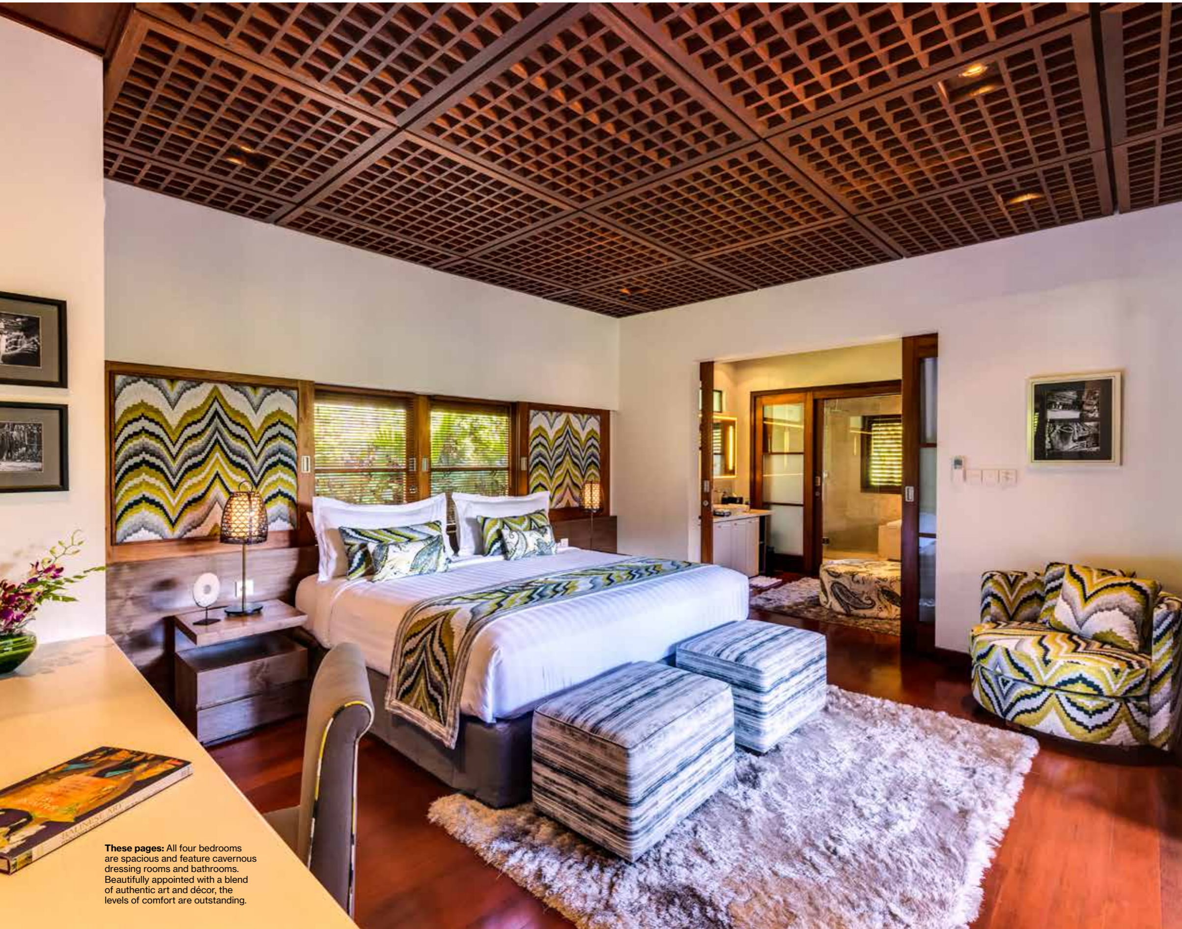
These pages: All four bedrooms are spacious and feature cavernous dressing rooms and bathrooms. Beautifully appointed with a blend of authentic art and décor, the levels of comfort are outstanding.

"...VILLA WINDU SARI IS A CHARMING, CONTEMPORARY DOUBLE-STORY LUXURY VILLA DESIGNED AND CONSTRUCTED TO PROVIDE EXCELLENT LEVELS OF COMFORT AND FUNCTIONALITY FOR ITS GUESTS..."