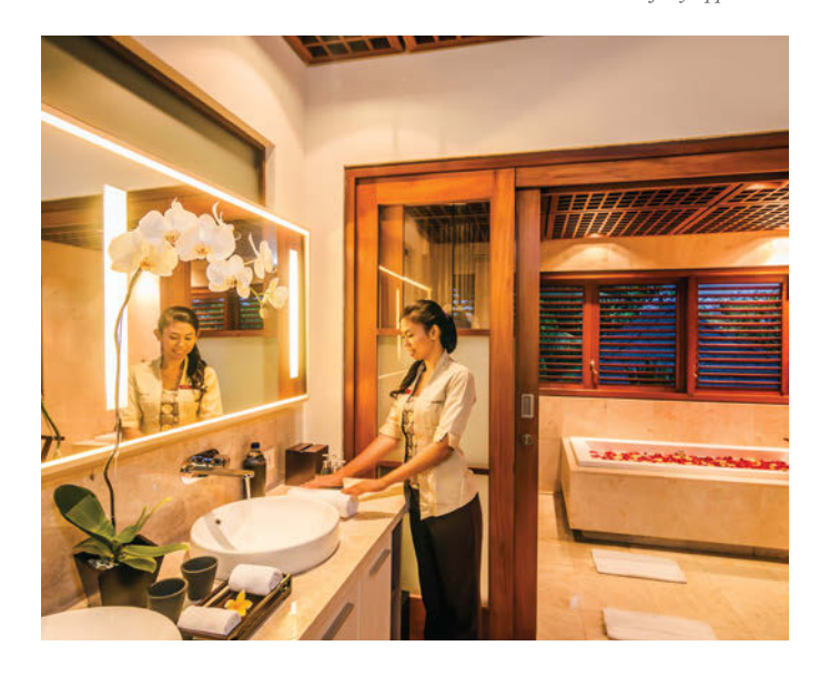
Bathrooms are tastefully appointed.

Designed by Australian architect, Glenn Parker, the two buildings that make up Windu Sari have been built predominantly from timber, with polished marble and Jogya stone floors. There has been no expense spared in the interiors and with a renovation just completed. which added new air-conditioners, beds and 40-inch TVs to the bedrooms, bathroom upgrades, new bed linen, towels, cushions, etc., and every surface either repainted, stained or re-polished, all fittings and details of this villa are in prime condition.