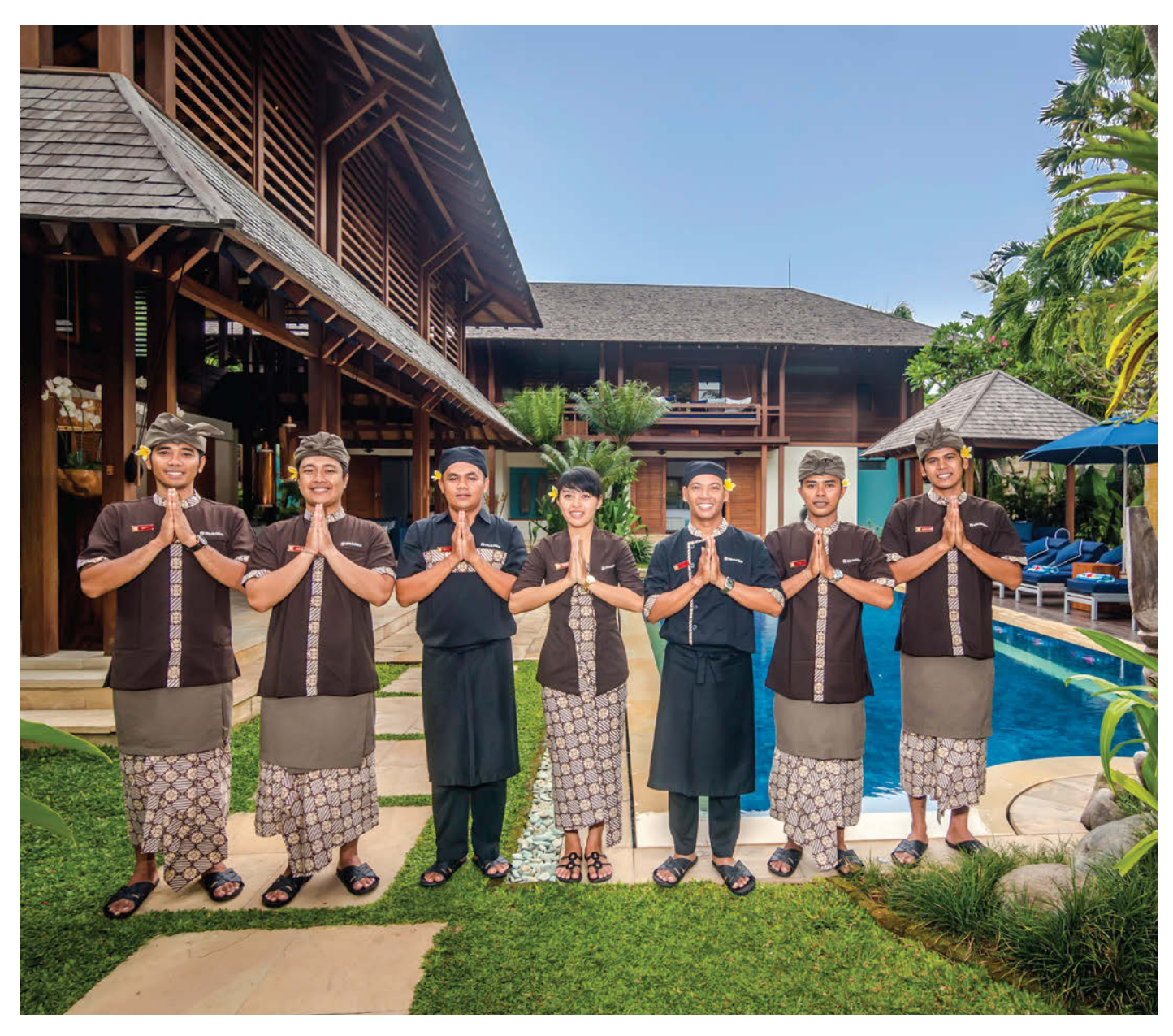
The friendly staff of Villa Windu Sari.

FRV goes behind a gate just off Jalan Petitenget to discover luxury, comfort, taste and style at Villa Windu Sari.