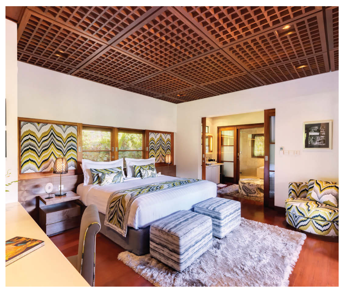
The senses are aroused in all bedrooms.

A pleasant perfumed scent greets you as you walk into the bedrooms. The hand towels in the bathrooms are also similarly perfumed and the feel of the fine fluffy rugs on the floor combine to make a sensorial feast of the nicest kind. The bedrooms are finely tuned to offer the perfect night's sleep – perfect bed, perfect air-conditioning and perfect detailing.